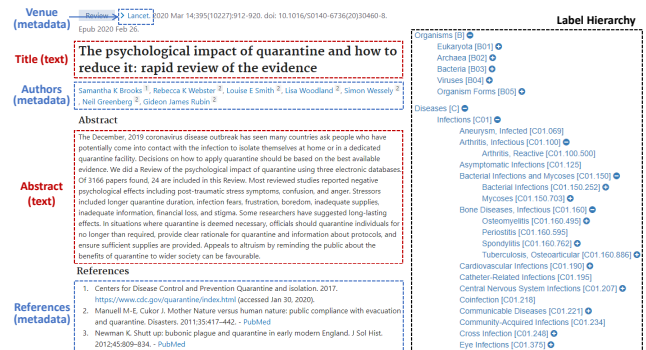
(a) Input: a PubMed paper with metadata